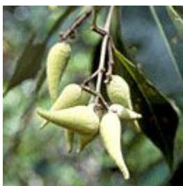
Fruits of Avicennia alba