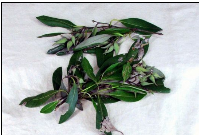
Aerial parts of Avicennia alba

cross shaped florescence. The fruit is pale green single seeded capsule flattened allover and have a conical elongated ellipsoid with seedling. The seeds are cotyledons which are erect and solitary. 8,9